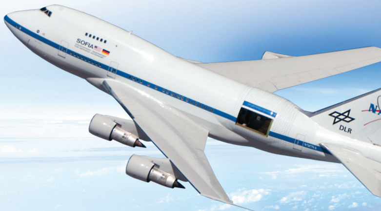
Stratospheric Observatory For Infrared Astronomy

While both these telescopes have immense value, they are different and their differences complement each other