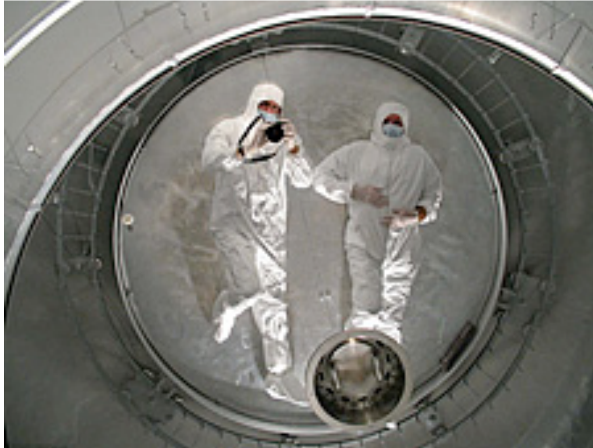
SOFIA Mirror with aluminum coating applied at ARC, June 2008