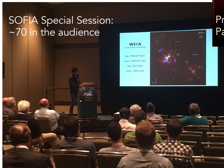
SOFIA Special Session: ~70 in the audience