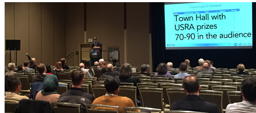
Town Hall with USRA prizes 70-90 in the audience