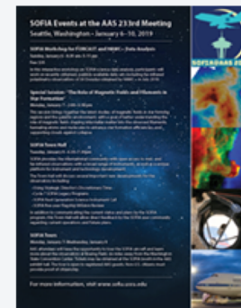
SOFIA at AAS flyer

This is a past event. View and download the presentations given at the 2019 Winter AAS SOFIA Workshop by selecting the links below. The Cookbook Recipes used in the workshop may be found here .