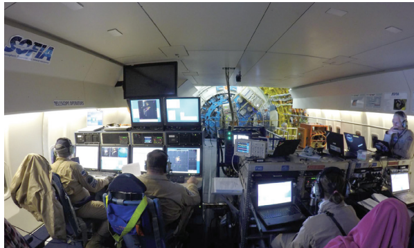
Scientists and technicians conduct nighttime observations on SOFIA.

The mobility of the observatory allows researchers to observe from both of Earth's hemispheres, and enables studies of transient events that often take place over oceans where there are no telescopes. Unlike space-based telescopes, SOFIA lands after each flight, so its telescope instruments can be exchanged, serviced or upgraded to harness new technologies. Because these new instruments can be tested and adjusted, SOFIA can serve as a testbed for technology that may one day fly in space. The observatory can also be used to train NASA's next generation of instrument builders.